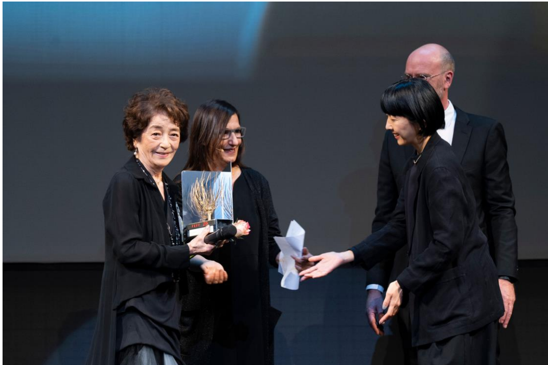
Baisho Chieko Golden Mulberry for Lifetime Achievement